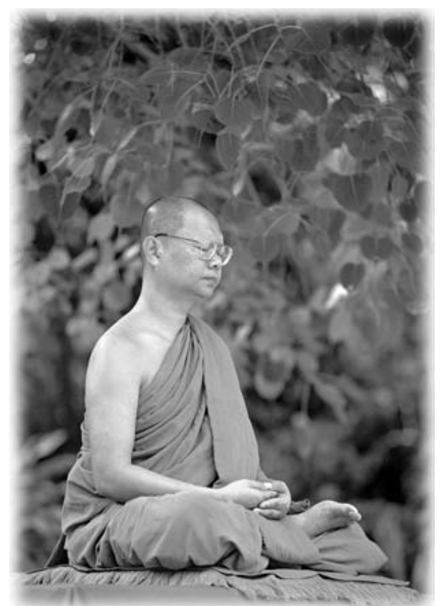
"Ordinarily, our mind is ceaselessly thinking and fantasising. To halt this flow of mental proliferation we need to practise meditation."